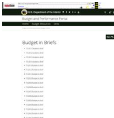
Screenshot 3.1a ( January 8, 2020 )