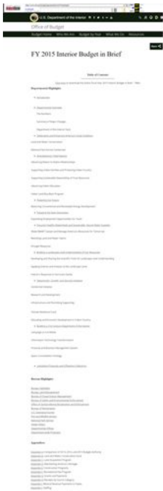
Screenshot 3.2a ( August 7, 2019 )