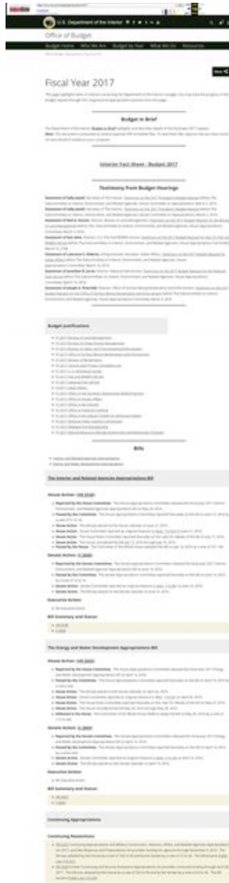
Screenshot 2.2a ( January 9, 2019 )