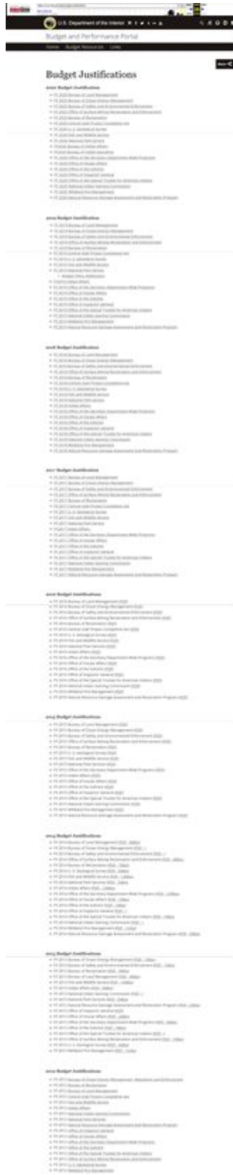
Screenshot 1.1a (April 20, 2020)